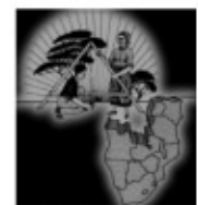
Plate forme Sous Régionale des Organisations Paysannes d'Afrique Centrale (PROPAC)

Coalition for the Protection of African Genetic Heritage (COPAGEN)